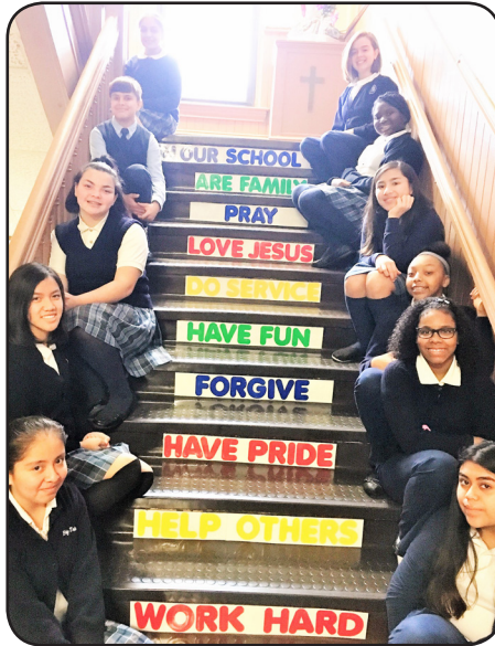
Students at OLSS begin the celebration of Catholic Schools Week.

"The mission of Our Lady Star of the Sea Regional School is to unite our multicultural community through the Catholic values of Academic excellence, compassionate service and respect for all."