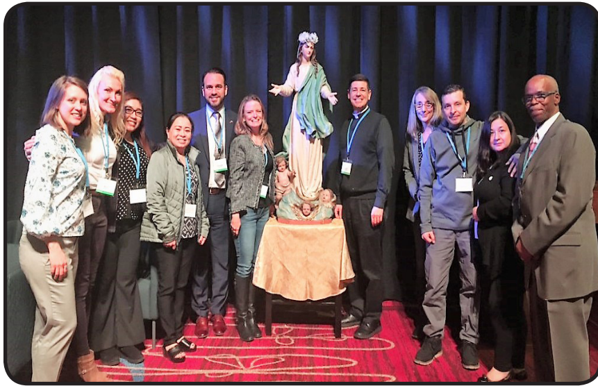
Pictured are the members of our parish who attended the Convocation of Catholic Leaders in Atlantic City. The theme was "Joy of the Gospel in South Jersey"; the delegates prayed, worshiped, attended workshops, and will now share what they have learned with the rest of our congregation.